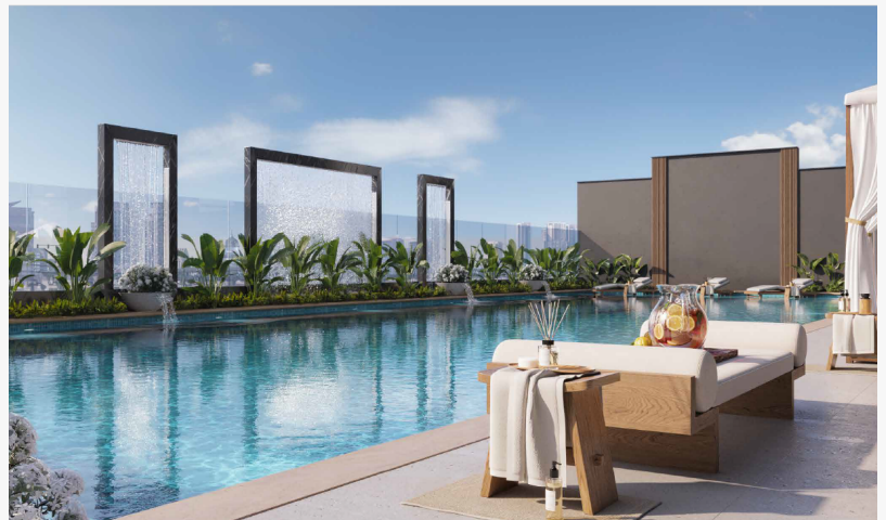
Aeternitas Tower will offer world leading amenities for residents to enjoy.