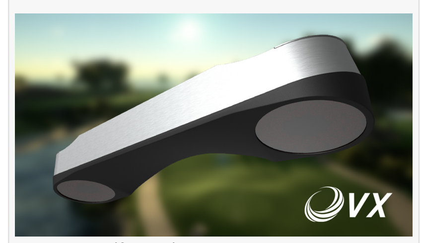
ProTee VX Golf Launch Monitor

unlike the other ProTee models the company is discontinuing.