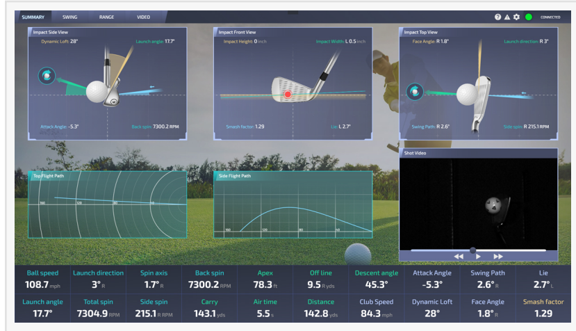
ProTee Golf Launch Monitor Shot Analysis Screen

Players share the importance of the amount and detail of data provided by the VX including ball data including ball speed, total spin, spin axis, back spin, side spin, launch direction and launch angle. Club data is also captured including club speed, swing path, club face angle, face to path, attack angle, dynamic loft, club lie angle, and both horizonal and vertical impact points. Finally, players can gather critical flight information, including flight path, apex