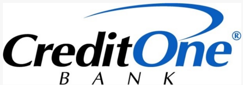
Credit One Bank logo