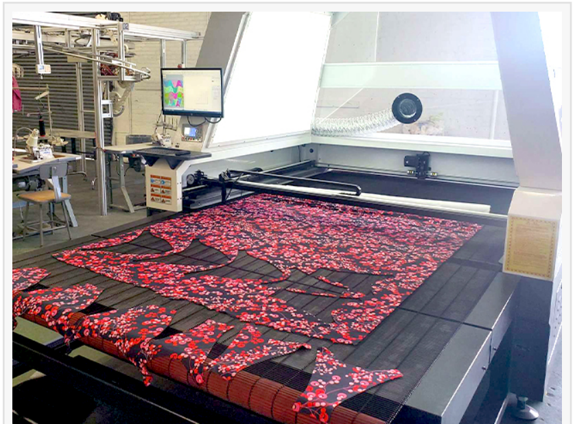
TUKAcut Laser Cutter at the Innovation Center by Tukatech

Though some brands have their own reshoring and nearshoring initiatives, it can be difficult to know where to start, because much of the talent and services that existed before outsourcing are no longer readily available. The Innovation Center by Tukatech is ready to assist these brands and manufacturers in transitioning to nearshoring or reshoring. The Center provides the resources to restart in-house development without the need to hire personnel, invest in equipment, or rent a building.