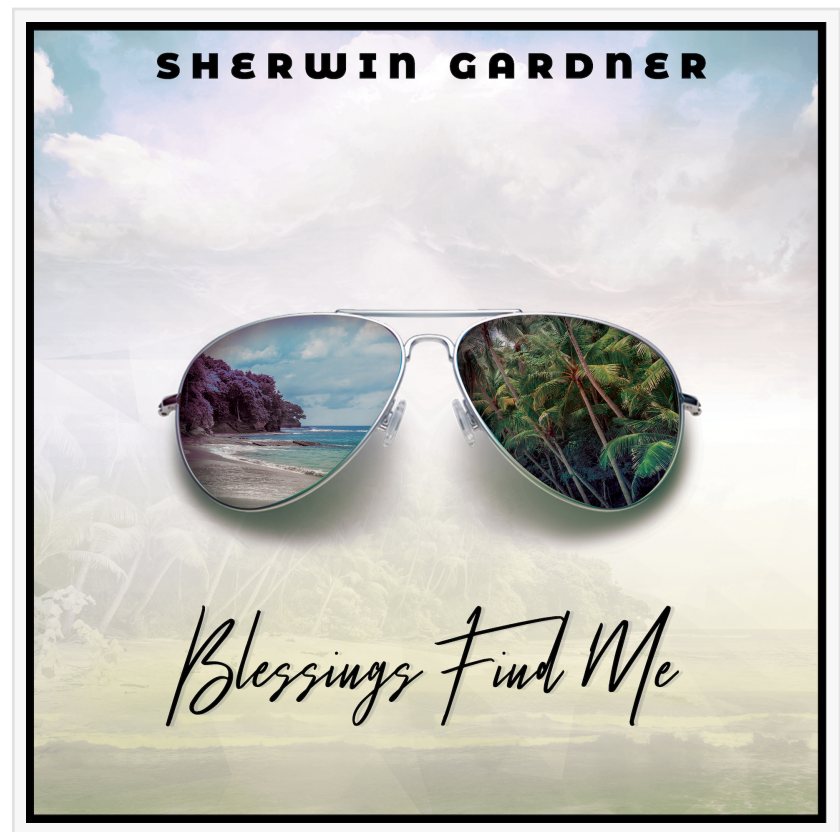
Blessings Find Me digital cover