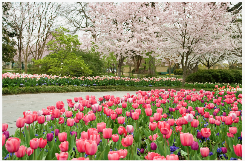
Dallas Blooms features half a million spring blooming flowers and cherry blossoms.