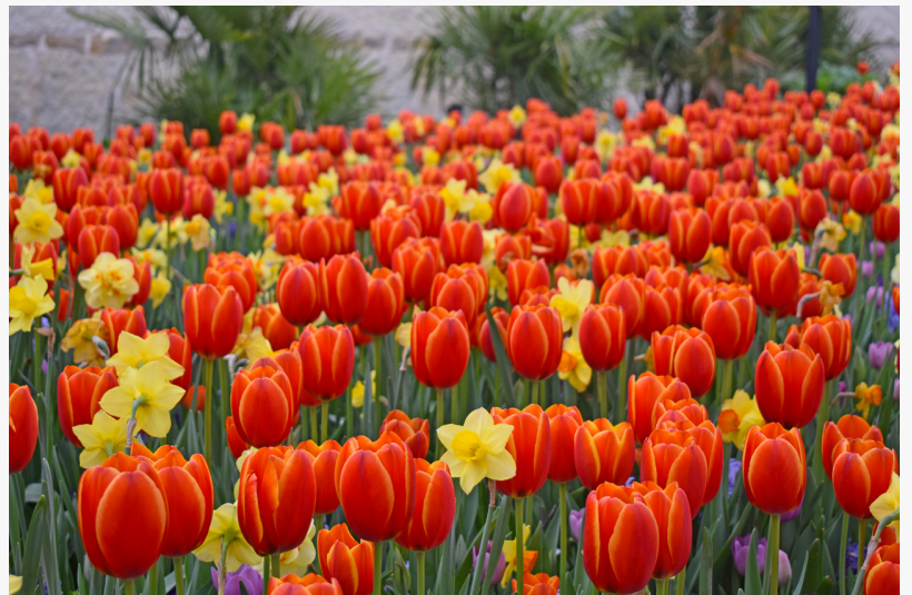
Dallas Blooms features half a million spring blooming flowers and cherry blossoms.