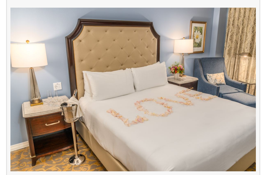
Add-ons from Sage 'n' Bloom like the rose petal turndown service are designed to make moments personalized and special.

expertly toasted Swiss meringue. It is paired with Donnafugata Ben Rye Passito di Panterlleria for the ultimate dining finale. Reservations may be made online at <a href="https://www.houstonian.com/events/valentines-at-the-manor">www.houstonian.com/events/valentines-at-the-manor</a>.