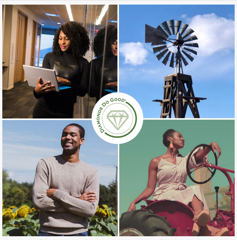
Diamonds Do Good® Entrepreneurship Grant -Launch image

GENEVA, SWITZERLAND, January 18, 2024 /EINPresswire.com/ -- UPG Biashara is an initiative that supports entrepreneurs in their journey to turn ideas into businesses. The unique ecosystem is built with a view that entrepreneurs make the world a better place and so they deserve support that maximises their chances of success. And this support is provided for free to 500 motivated entrepreneurs who earn their place by demonstrating their ideas and their passion. Namibia is on a shortlist of priority countries thanks to the Diamonds Do Good® Entrepreneurship Grant and this