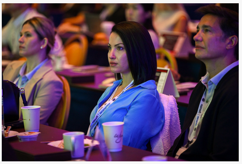
Attendees at DERM2023 listen attentively to educational presentation.

STDs. There are in-depth discussions of the diagnosis and treatment of skin diseases, including use of biologic and other emerging treatments for eczema, psoriasis, and other immune mediated diseases. Special highlights of the educational program include in-depth dermoscopy training and sessions focused on cosmetic dermatology and skin care. Presentations are case-based with lots of chances for audience participation, Q&As, and opportunities to speak one-on-one with a robust faculty of practicing NPs, PAs, and physicians, among other third-party experts in healthcare, job placement, policy, and specialty medication access.