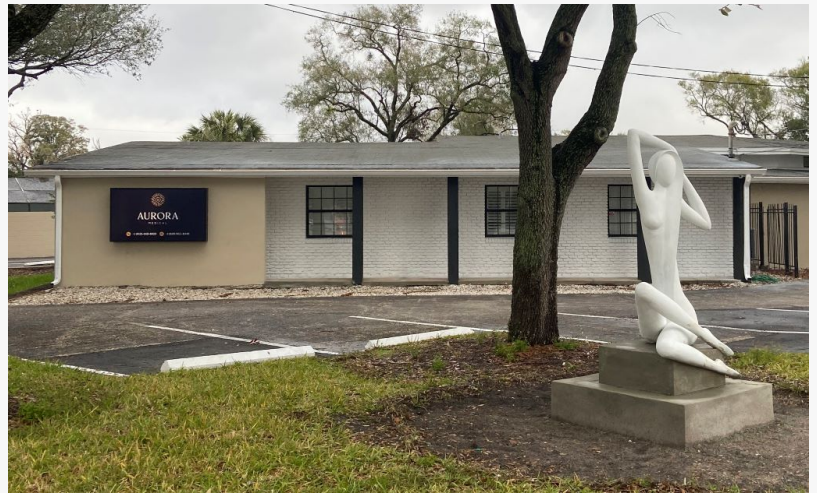
The Aurora Office Building

TAMPA, FLORIDA, UNITED STATES, January 29, 2024 /EINPresswire.com/ -- Aurora Medical Group, a leading provider of cosmetic and personal injury treatments in Tampa, is proud to announce a series of glowing testimonials from satisfied patients, highlighting the clinic's commitment to excellence in patient care and innovative medical services.