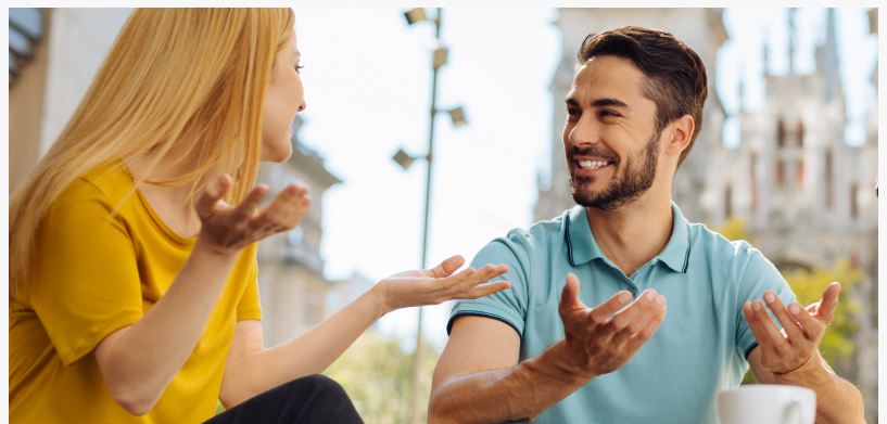
Séjour linguistique Adultes

ZURICH, SWITZERLAND, January 18, 2024 /EINPresswire.com/ -- In 2023, Aventure Linguistique , formerly based in Nyon, joined the StudyLingua Group, strengthening its position as one of the leading language travel organisers in French-speaking Switzerland.