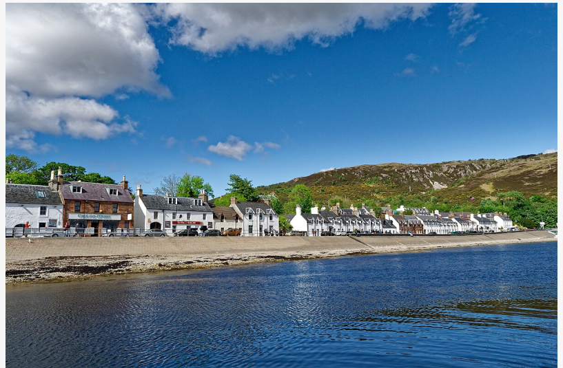
Ullapool village seaside