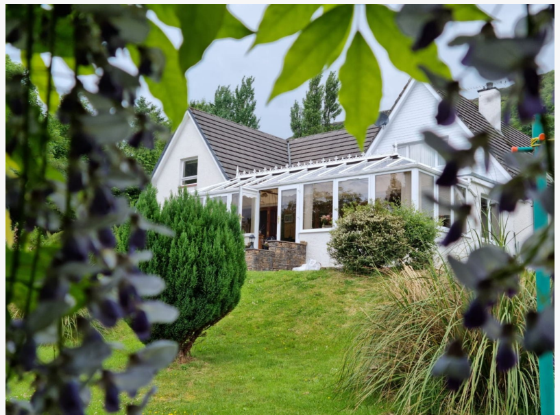
Lochview Guest House