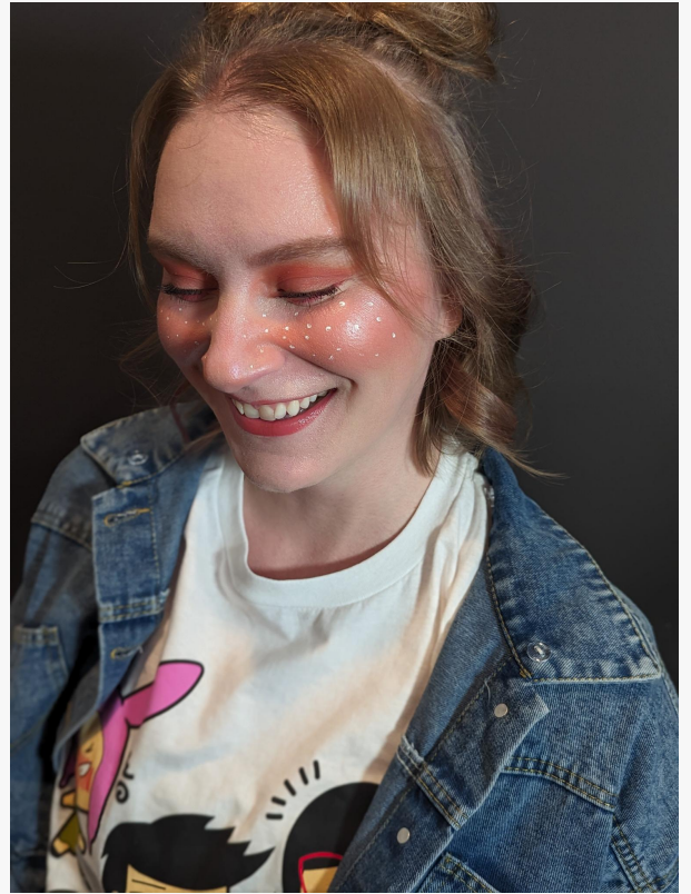
"Whimsical Energy" Peach Fuzz Makeup Look

WarPaint International Beauty Agency is the ultimate symbol of luxury and excellence in hair and makeup artistry. Offering on-site beauty services, WarPaint International caters to clients in Minneapolis, Chicago, and Jacksonville, blending the whimsy of fashion with practical needs.