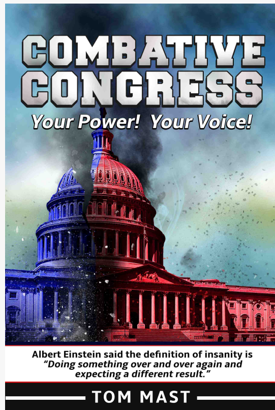
Combative Congress front cover