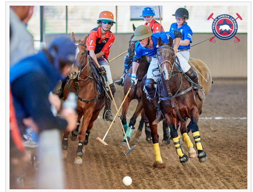
Texas Arena League polo players in action at Brookshire Polo Club, Houston.