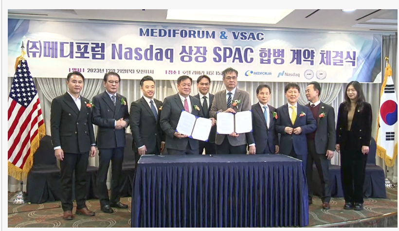
Mediforum - VSAC - Signing Ceremony

treatment in the field of life sciences after its launch."