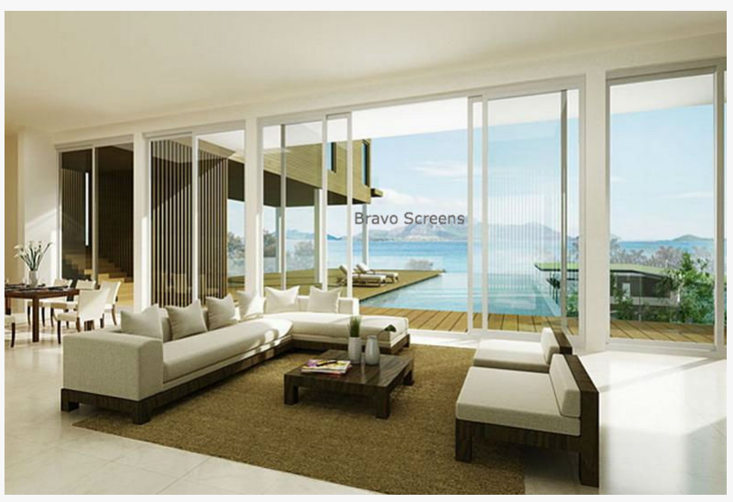
Retractable Patio motorized Screens