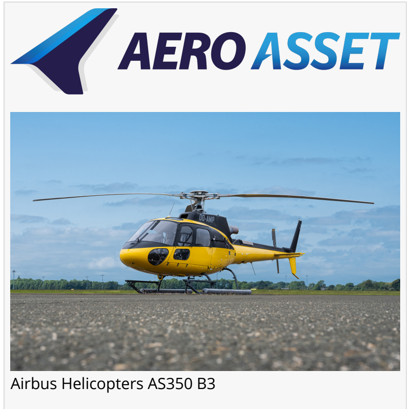
Airbus Helicopters AS350 B3