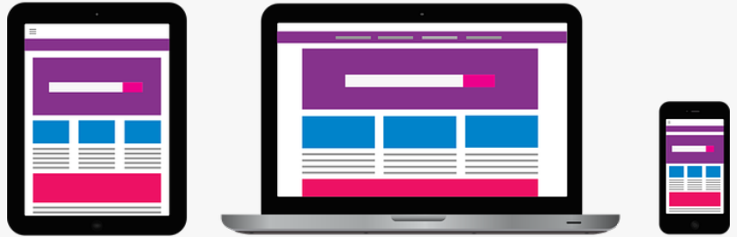
Free Tax Filing Online

Another benefit of online tax filing is that it is more accurate. The software used by tax