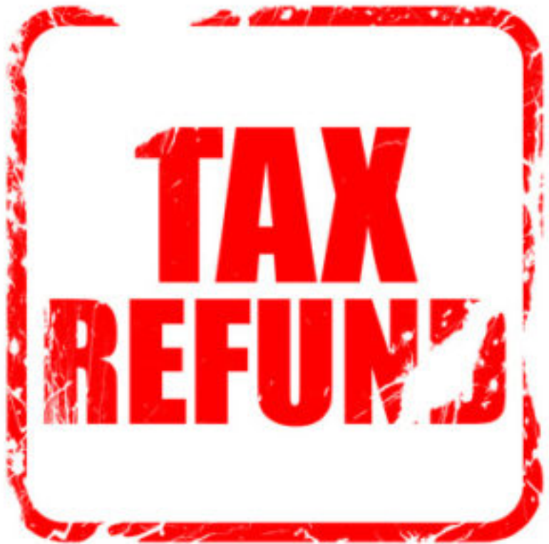
Tax Refunds in 2024