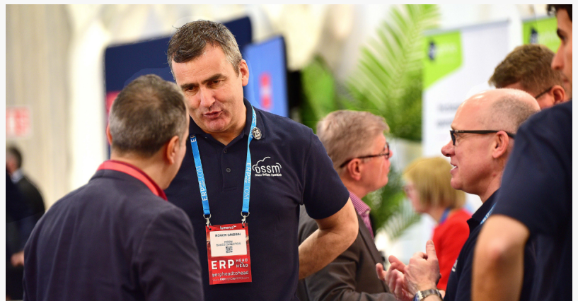
Lumenia ERP HEADtoHEAD event, 13-14 March, compare the leading ERP solutions

The event kicks off with the ERP vendors take part in an 'Elevator Pitch'. During this session the vendors present a summary of their USP's to convince delegates why it would be a good idea to attend their on-line demonstrations. Delegates can then choose to attend demo sessions focused on Finance, Production, Procurement, HR, Projects or Sales. The demonstrations are