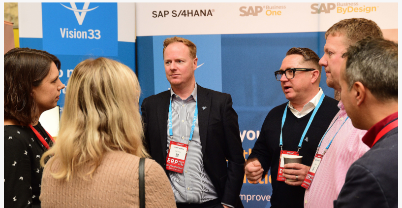
Lumenia ERP HEADtoHEAD event, 13-14 March, meet the leading ERP vendors