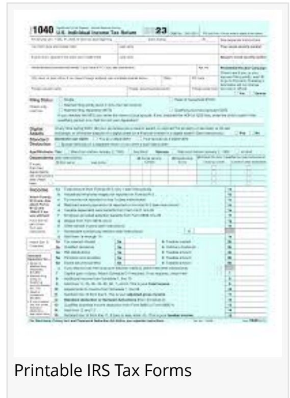
Printable IRS Tax Forms