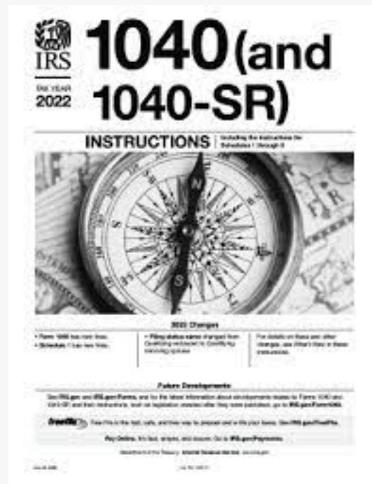
IRS Tax Form Instructions