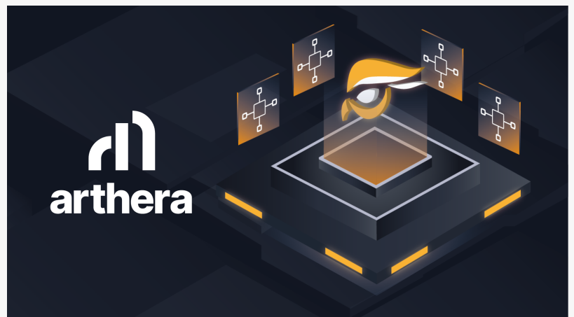
Raptoreum Strategically Partners with Arthera