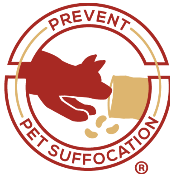
Prevent Pet Suffocation Logo

We can reduce the number of accidental pet deaths by educating the public on the dangers of