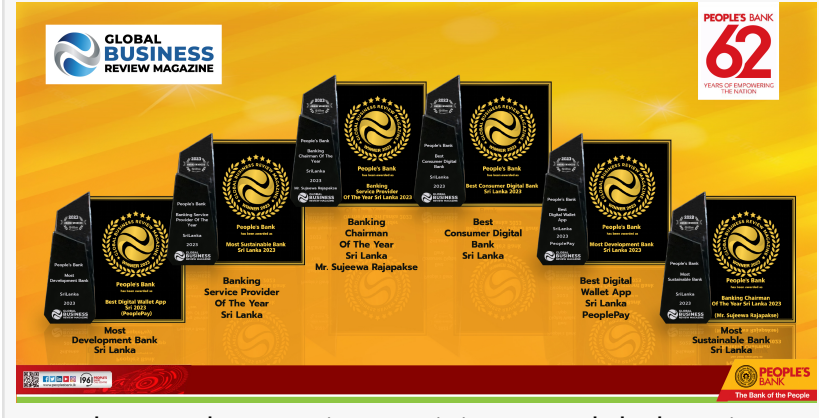
People's Bank Won Six Prestigious at Global Business Review Magazine Awards 2023