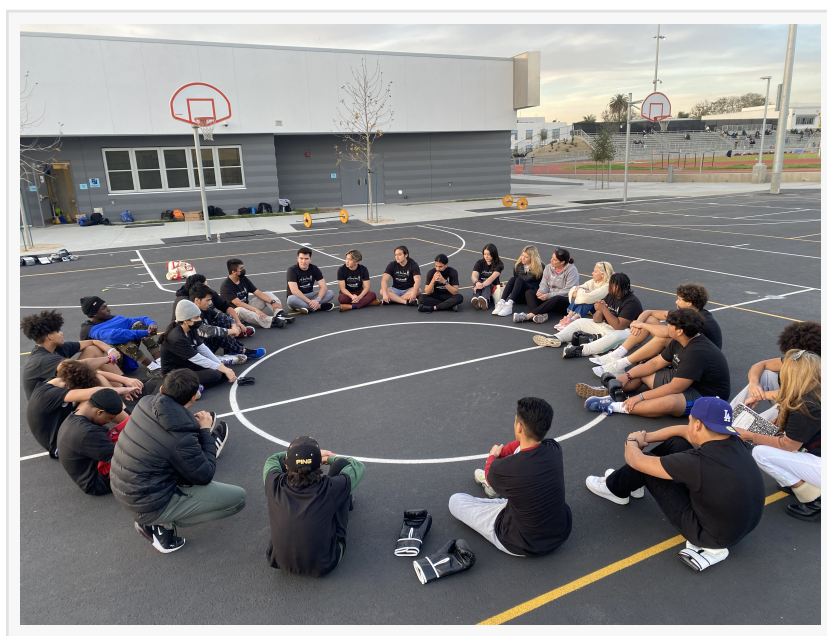
Recent Amalfi Foundation Philanthropic Event

The foundation, headquartered in Agoura Hills, California, focuses on aiding unhoused individuals in the Los