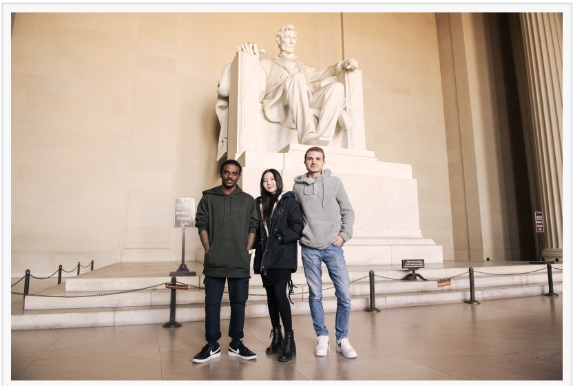
LADO STUDENTS 2

Known for its international outreach, Lado International Institute will participate in the upcoming ICEF Fairs for ONLINE programs from January 29 to 31, 2024, and the Japan-Korea Roadshow 2024 from February 27 to 29, 2024. These events serve as opportunities to connect with new agents who will enhance the Institute's brand abroad and bring in new students eager to learn English.