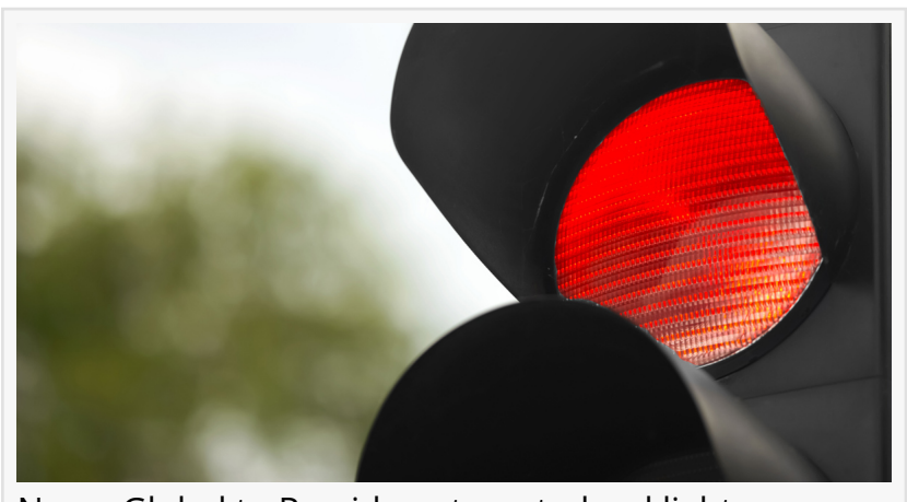
NovoaGlobal to Provide automated red light enforcement

ORLANDO, FL, ORANGE, February 6, 2024 /EINPresswire.com/ --<u>NovoaGlobal, Inc.</u>, a leading provider of advanced traffic safety enforcement technology, is proud to announce Pensacola, Florida's signed a contract with NovoaGlobal to implement <u>red</u> <u>light photo enforcement systems</u> and manage its Automated Traffic Enforcement Program. As a leading national developer and manufacturer