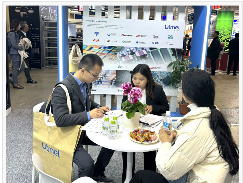
Utmel staff engaging with customers

Utmel, located at booth E23-48, had a booth space with a modern and stylish design that caught the attention of passersby, attracting a lot of interest and inquiries from attending clients. The staff members of Utmel consistently engaged in communication and discussions with visitors, displaying their enthusiasm and genuine attitude. They patiently discussed with the attendees, resulting in a lively and harmonious atmosphere. Many participants expressed their intention for further discussions and potential collaborations on the spot.