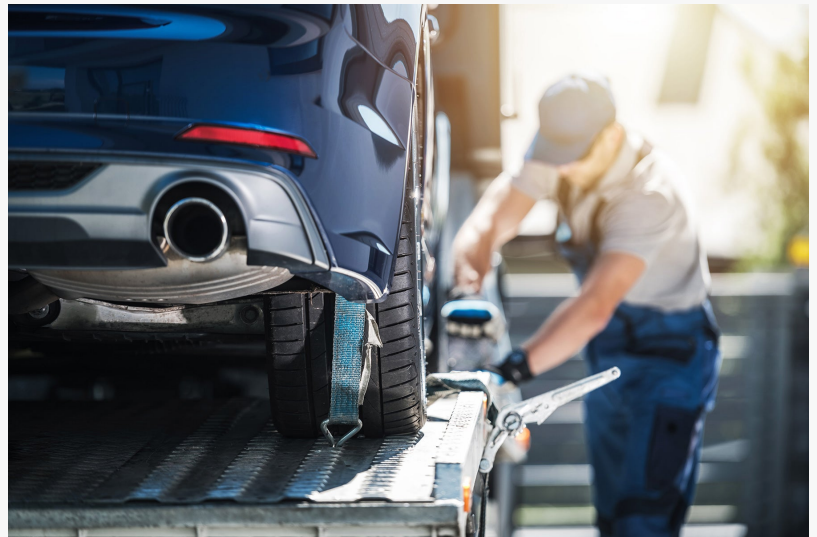
Don Hinds Ford, Inc. can now service large commercial vehicles of all kinds

The service bays have ample space to easily accommodate a variety of large vehicles, including long-haul trucks, buses, specialty vehicles, and municipal fleet vehicles. The new service bays are designed with innovation and sophisticated capabilities to specifically cater to the different