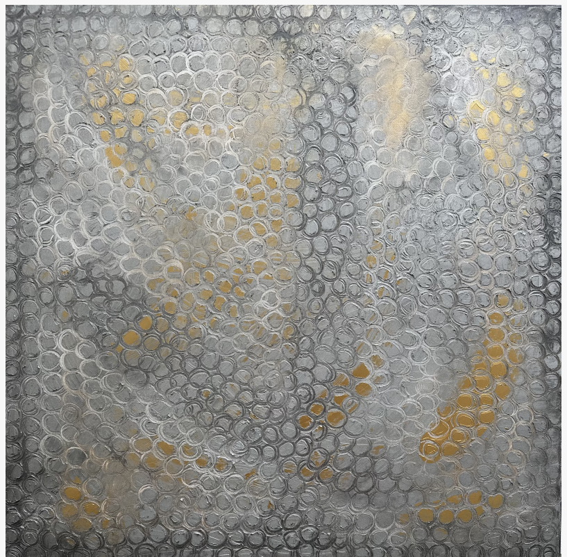
Jazz Silver Moonlight | by Kimberly Dawnly | 24 x 24 inches | Oil on Canvas

- Amsler Damask (@amslerdamask): Amsler Damask, born 1967 in Vienna, is a celebrated abstract oil painter known for his colorful grid paintings. He currently resides in Brooklyn, using thick oil paint and artist knives to create emotionally powerful compositions inspired by 1950s abstract artists.