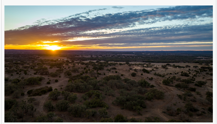
With 1,440 feet of frontage along Highway 290 and unencumbered by zoning restrictions, the remaining available 40-acre tract is prime for commercial development.

Puerta del Lobo will provide 100, 1.5-acre lots with stellar views perfectly matched with producing vineyards.