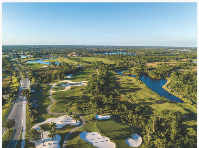
Tesoro Club's Championship Golf Course

/EINPresswire.com/ -- Tesoro Club , a 1,490-acre premier gated golf club community located in the heart of Florida's Treasure Coast, will host the PGA Tour's Cognizant Classic Open Qualifier, February 25-26, on its newly renovated Arnold Palmer Championship Golf Course. Players in the qualifying tournament will vie for four open spots in the Cognizant Classic, formerly known as the Honda Classic, marking the second year in a row that Tesoro Club hosted the event.