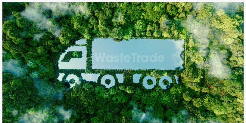
Creating a greener world

With these enhancements, WasteTrade's online marketplace is setting a new standard in the plastic recycling industry. It offers a streamlined, economically viable, and environmentally conscious solution for businesses worldwide. This development marks a significant stride towards a more sustainable and efficient future in plastic recycling.