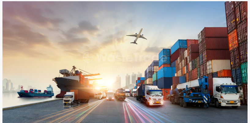
WasteTrade are cutting the transportation carbon footprint of waste across all logistics