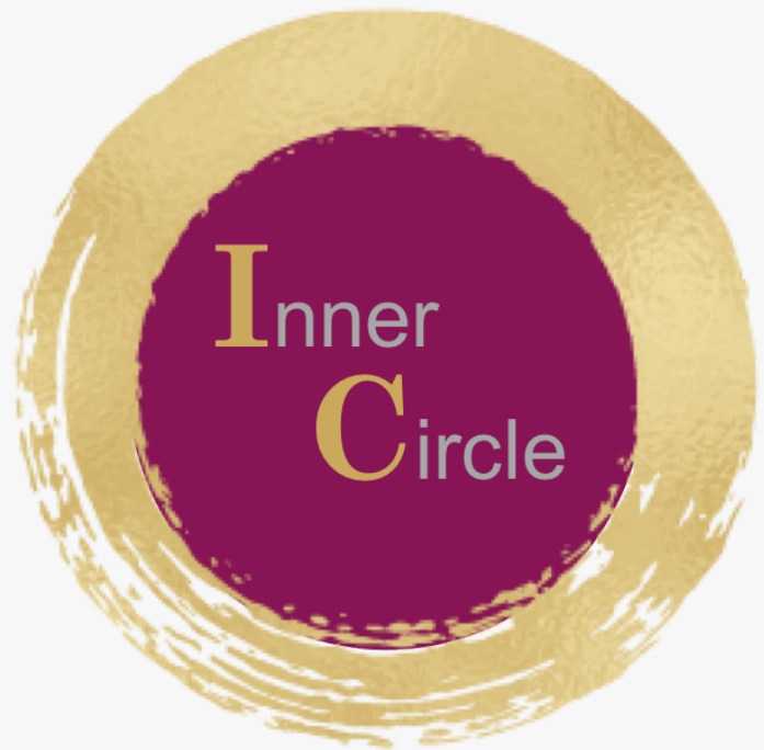
The Inner Circle

This press release can be viewed online at: https://www.einpresswire.com/article/683584877