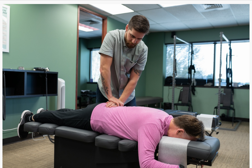
Chiropractic Adjustment Back