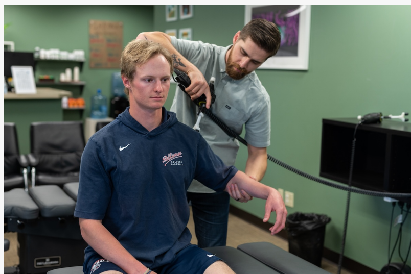
Shoulder Chiropractic Treatment