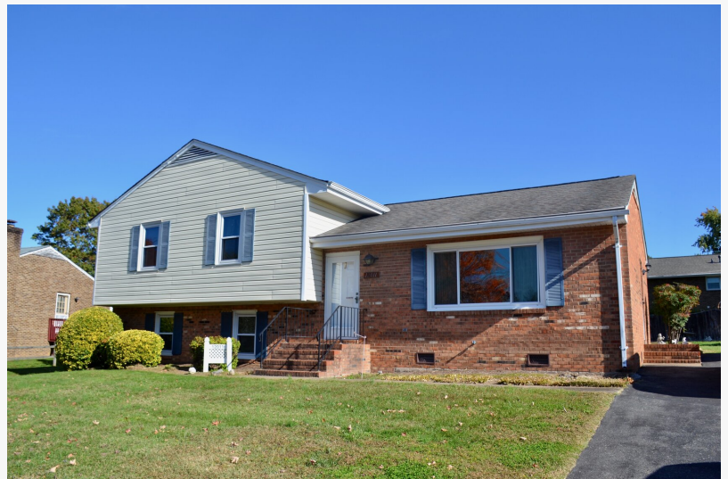
12011 Prosperity Ct., Fredericksburg, VA 22407