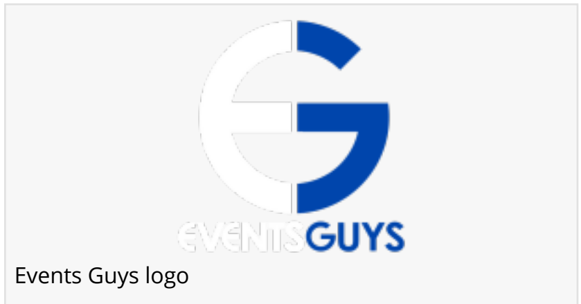
Events Guys logo

Some of the prominent collaborations that Events Guys is extremely proud of is their partnerships with Athletics South Africa, B&W Productions, Hey Neighbour and Ultra Festival. As the trusted event management company behind several high-profile athletic events, Events Guys has proven their expertise and professionalism in organizing small and large-scale events. By combining their technical know-how with their passion for creating memorable experiences,