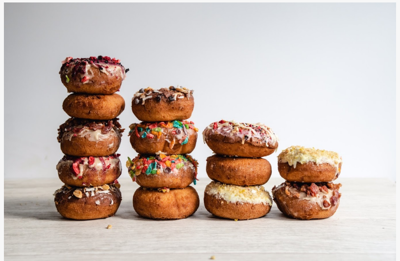
Baked Goods from Bakehouse46

For more information, menus, and ongoing promotions, visit www.bakehouse46.com .