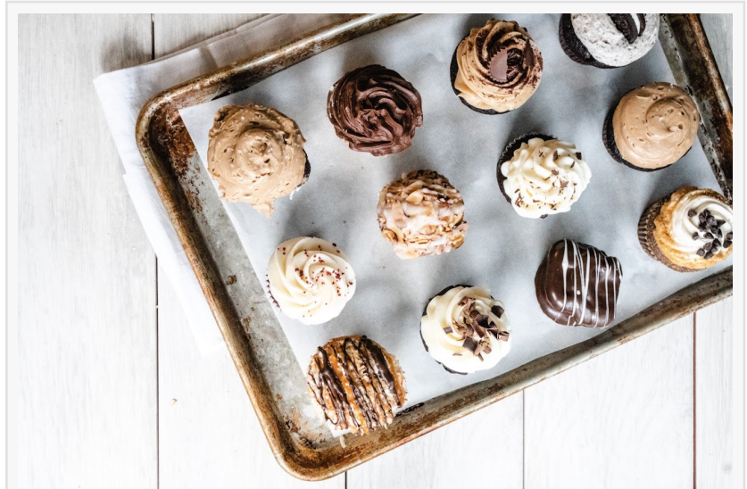
Cupcakes from Bakehouse46