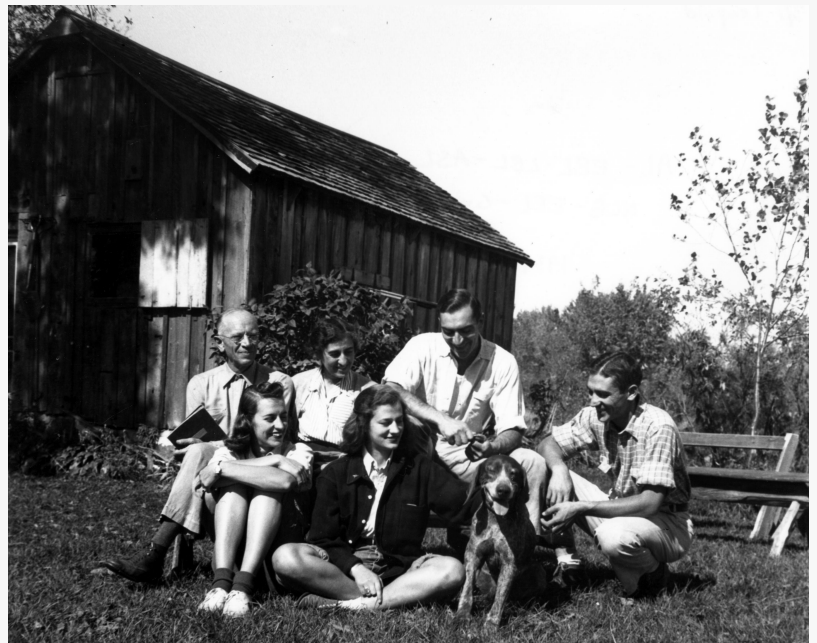
Aldo Leopold Family at The Shack