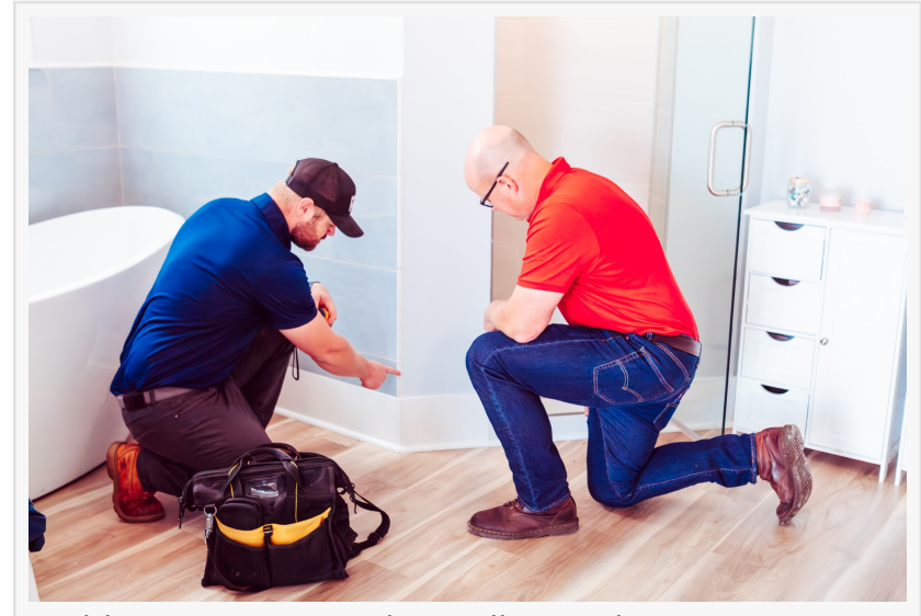
Mold Inspection in Jacksonville Beach