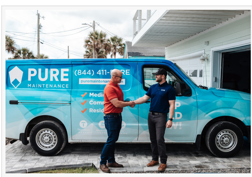
Mold Remediation Project in Neptune Beach, FL

JACKSONVILLE BEACH, FLORIDA, USA, January 31, 2024 /EINPresswire.com/ -- Pure Maintenance Mold Remediation is proud to announce the opening of a new location in Jacksonville Beach, Florida, opened May 2023. With the expansion, the company brings its innovative and superior mold remediation services to the residents and businesses in the area.