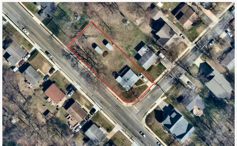
123 Dogwood St. SW, Vienna, VA 22180