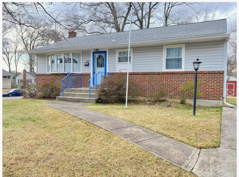
123 Dogwood St. SW, Vienna, VA 22180