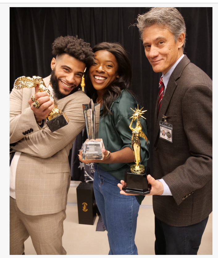
Celebrating 46 Wins

Public Information Division Chambers TV Series LLC +1 347-512-8931 email us here Visit us on social media: Facebook Twitter LinkedIn Instagram YouTube TikTok Other