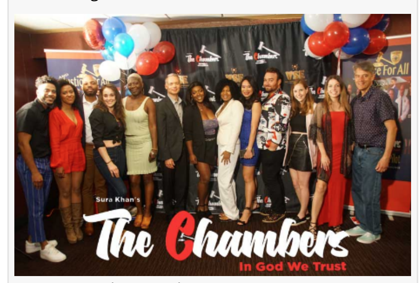
Premiere Night AMC Theaters

This press release can be viewed online at: https://www.einpresswire.com/article/683962040