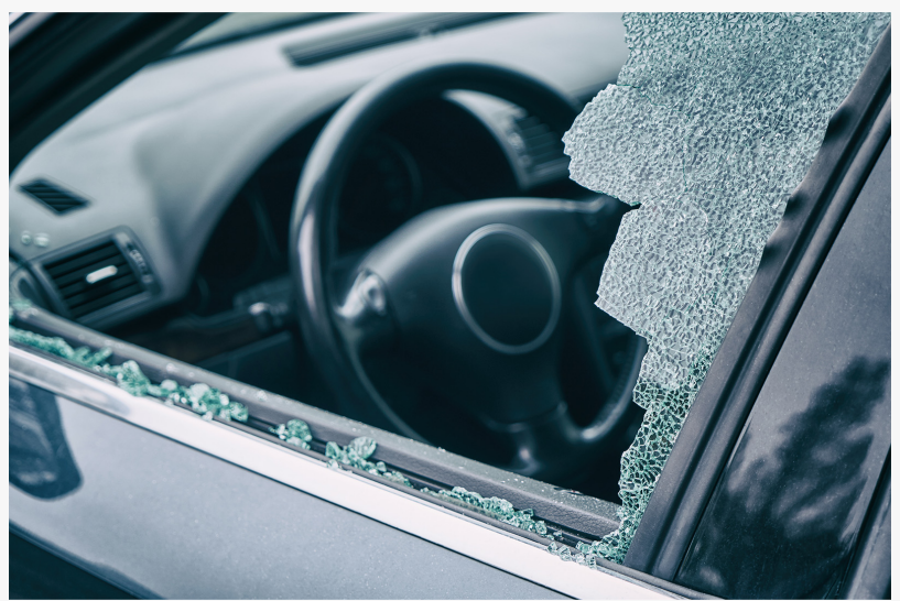
Broken glass from a smash-and-grab Crime