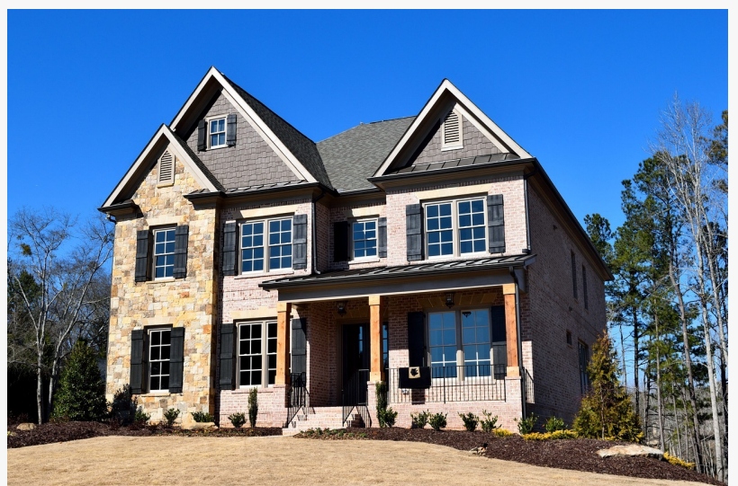
Powerful ways to secure your home.

OREM, UTAH, UNITED STATES, February 8, 2024 /EINPresswire.com/ -- With the recent surge in crime rates and security threats , CEO's and business owners are no longer taking any chances when it comes to protecting their businesses, homes, and vehicles. In light of recent attacks, riots, retaliation by former employees, robberies, and more, companies like Armittek have stepped up to provide top-notch security solutions such as bulletproof glass and security film.