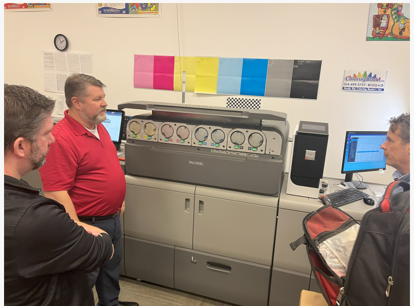
Color Management Skills Printing High Quality Jobs for Clients

This press release can be viewed online at: https://www.einpresswire.com/article/684099919 EIN Presswire's priority is source transparency. We do not allow opaque clients, and our editors try to be careful about weeding out false and misleading content. As a user, if you see something we have missed, please do bring it to our attention. Your help is welcome. EIN Presswire,