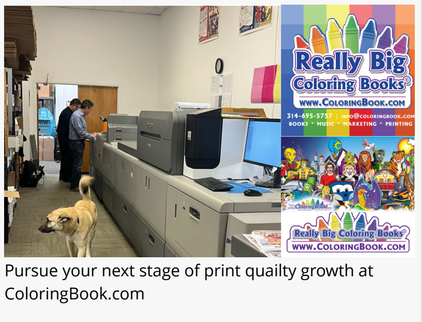
Pursue your next stage of print quality growth at ColoringBook.com

ST. LOUIS, MO, USA, January 28, 2024 /EINPresswire.com/ -- St. Louis based Really Big Coloring Books® | ColoringBook.com® acquires new high end digital print machines and technology expanding print on demand services; from one book up to millions of copies for client base and new customers. Scalable with affordable products, the new digital presses showcase Color Sheet-Fed Printers in a top-of-the-line system built for today's realities to prepare and print for what's next.