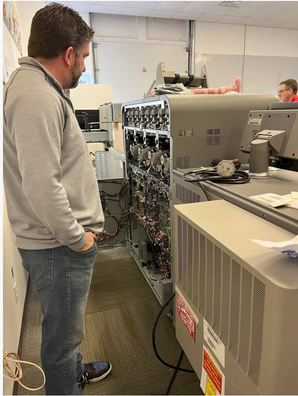
High end digital print quality growth at Really Big Coloring Books® | ColoringBook.com