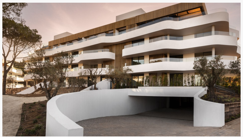
Facade Village Verde Sotogrande by L35

The architectural prowess of Village Verde is validated by its GOOD rating from BREEAM