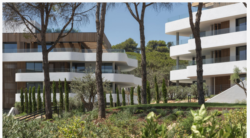
Panoramic view of Village Verde Sotogrande by L35

Southern Spain. This exclusive residential project, having successfully completed its first phase in July 2023, is a testament to the firm's commitment to blending cutting-edge conceptual design with sustainable living.