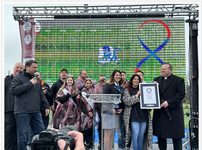
Guinness Record Presentation

The previous World Record holders brought together 998 people, this past Friday, 1,540 people were counted setting the new record. In addition to breaking the record, the event will also be featured in a segment being created for the nationally syndicated television show View Point With Dennis Quaid. The feature is slated to run this coming April during autism awareness month.