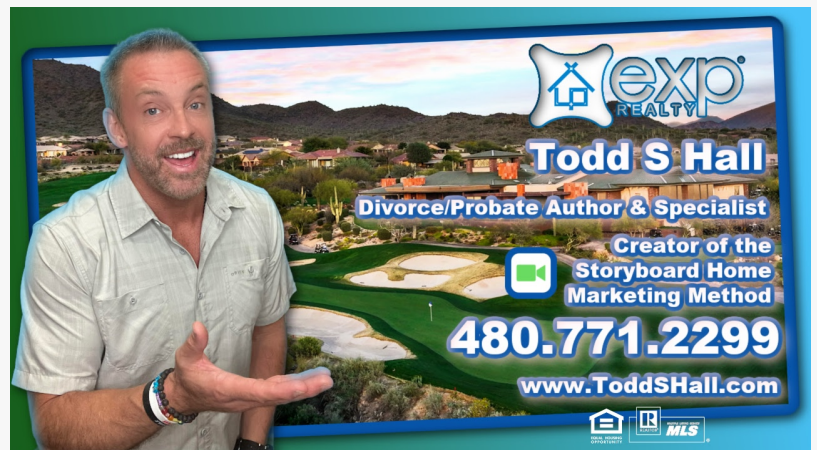
Phoenix Real Estate Divorce Agent, Expert & Author