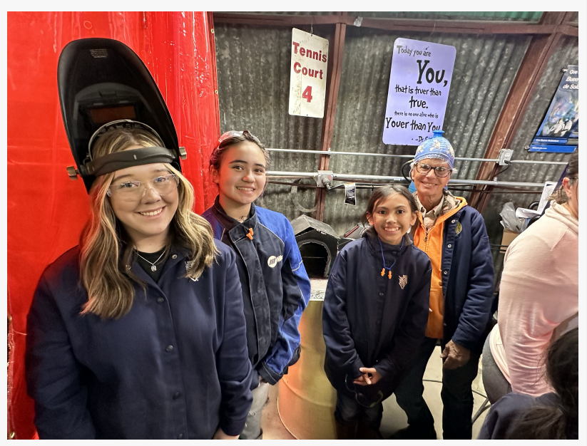
Students ages 10-17 learn to weld