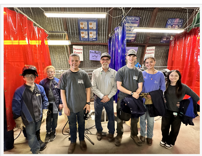
Youth Welding Challenge Winners

The competition, which was open to local home-school students between the ages of 8 and 18, brought in