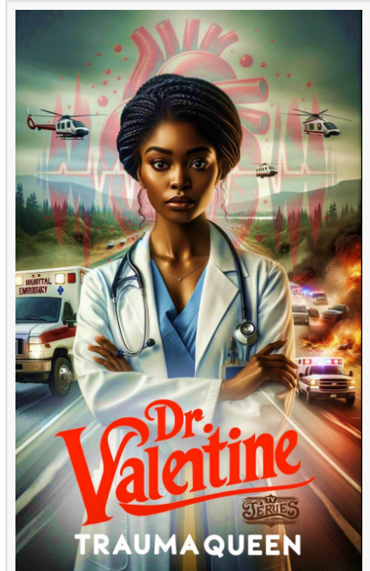
Dr. Valentine: TRAUMA Queen Poster

Power Star Entertainment's "Dr. Valentine: TRAUMA Queen" stands as a testament to the power of storytelling, proving that in the hands of visionary creators, a TV series can do more than