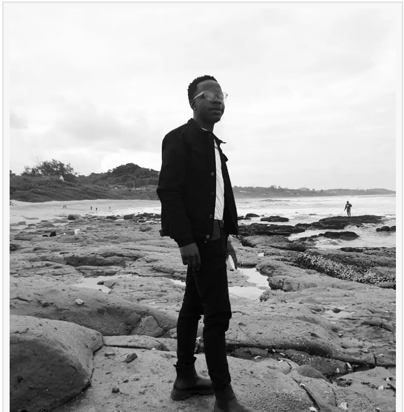
Feechy, NCMG Africa

Prepare for a sonic revolution as NCMG Africa's global distribution channels catapult South African artists from the Music G.O.A.T Talent Search into international stardom. Music GOAT envisions a future where artists' music is distributed globally, complemented by international media interviews, press conferences, TV performances, and electrifying live shows.